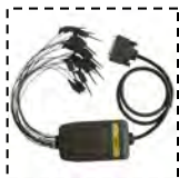
Logic Analyzer Module