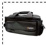
Soft Bag (optional)