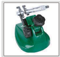
micrometer stand with clamp (optional)