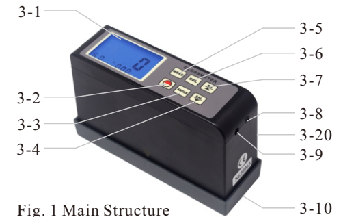
Fig. 1 Main Structure

Reading Value of 60° comes out on the display. Also press the Read/Plus Key or the Calibration/Minus Key for adjustment to the indicated value on the Calibration Box. Press the Measurement Key to confirm. The setting of calibration value is finished.