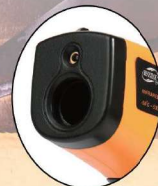
Temperature sensor and positioning laser