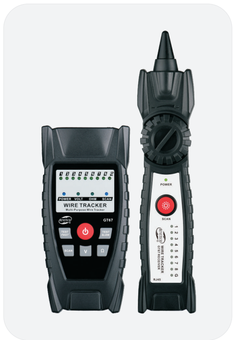
Standard:Q/GMY 020-2015 Version:GT67-EN-01