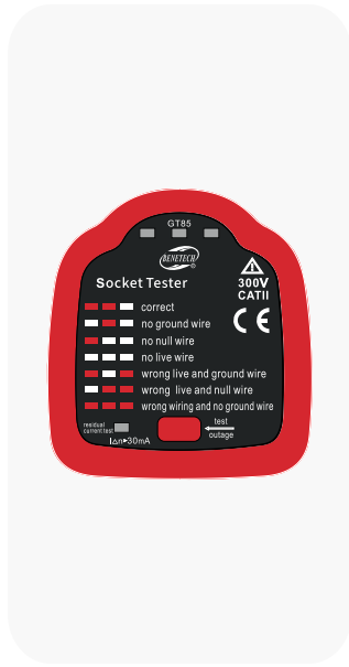
Version : GT85-EN-00