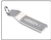
software flash disk (included)