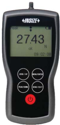
ISF-DF100A type A