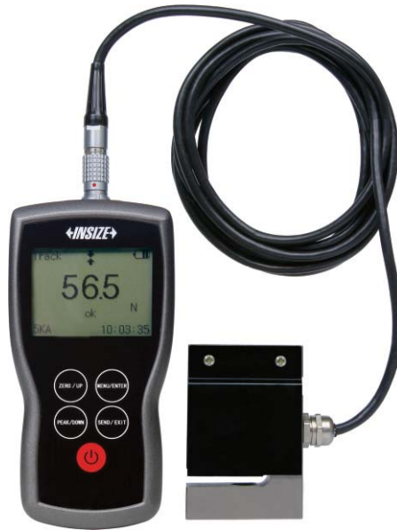
ISF-DF5KA type B