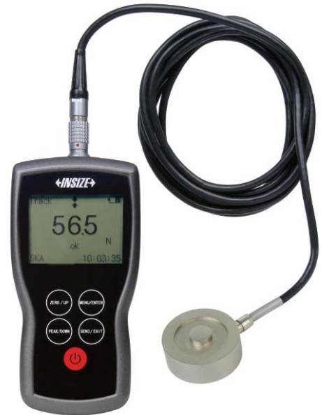
ISF-DF10KC type C