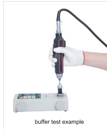
buffer test example