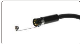
magnet pick up (included)