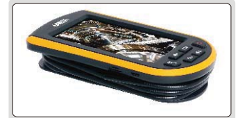
cable can be wrapped around the main unit