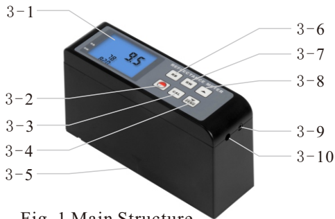
Fig. 1 Main Structure